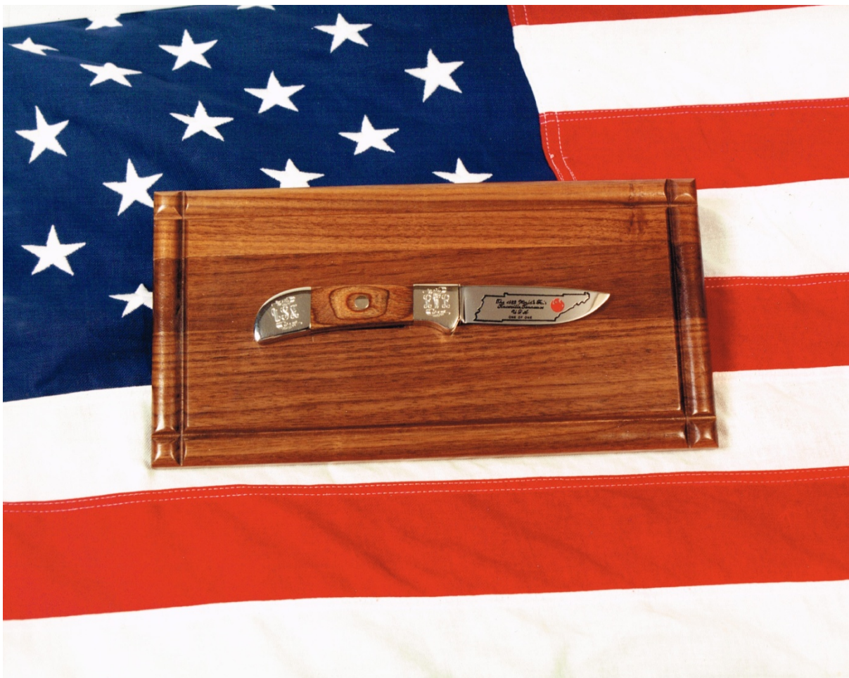
Photograph of the Queen Cutlery Commemorative 1982 World's Fair Knife